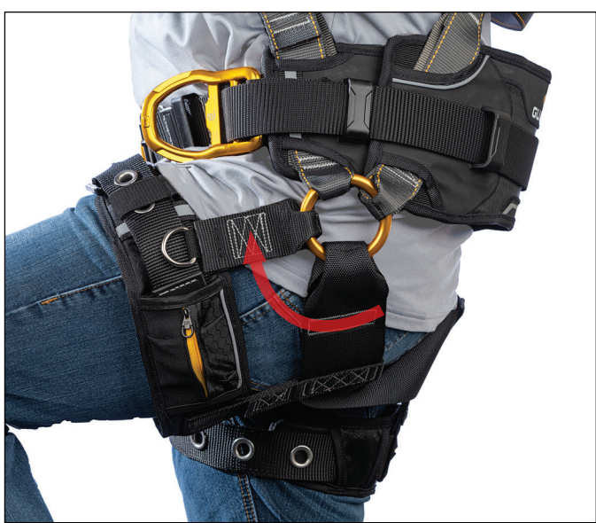
Full range of unrestricted movement