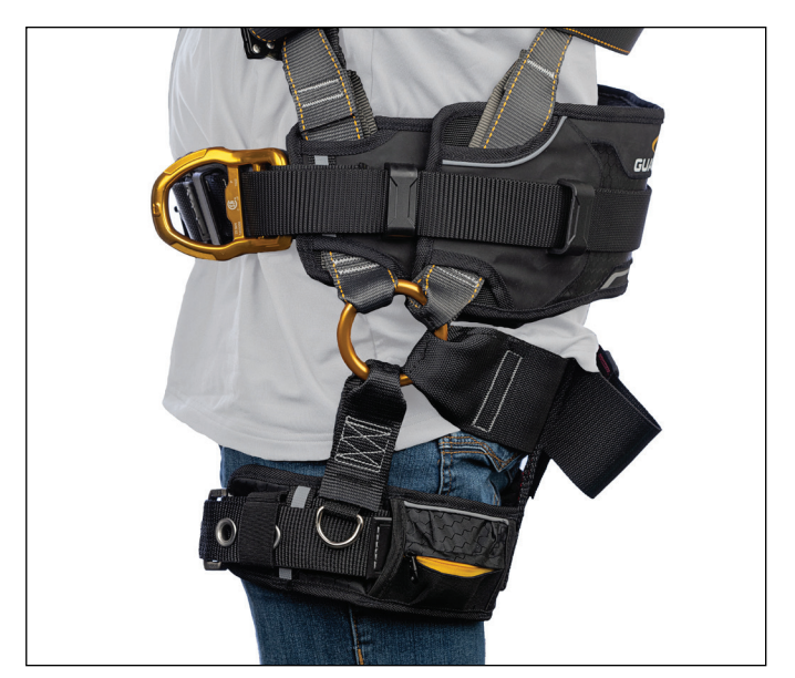
Unique O-Ring chassis design